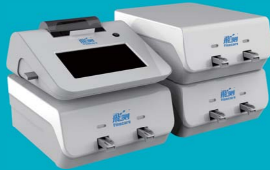
Finecare™ Multi-channel FIA Meter

High throughput, Full-automatic, Continuous, Rapid, Accurate quantitative. Click and test, only 2 steps.