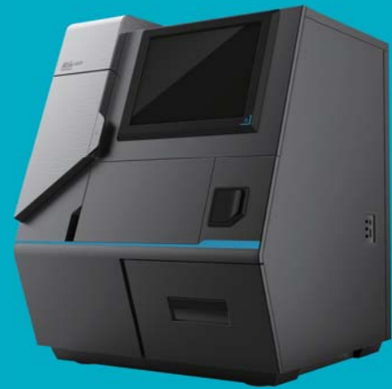
Finecare™ Full-automatic FIA Meter